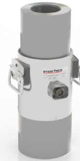
Model 2200 (Shown)