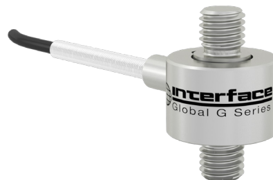
Model GWMC-50KN-N-3 (Shown)