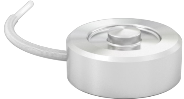
Model LBM-5K (Shown)