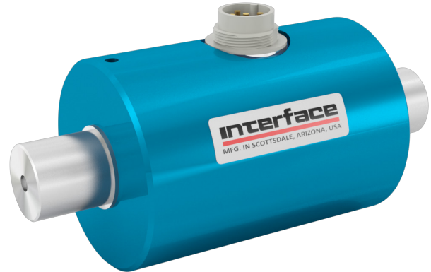
MODEL TS12 (Shown)