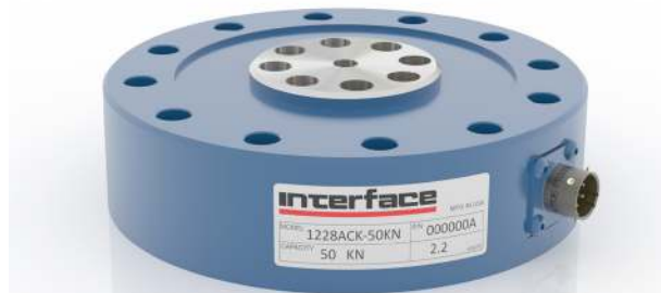
Model 1228ACK-50K (shown)