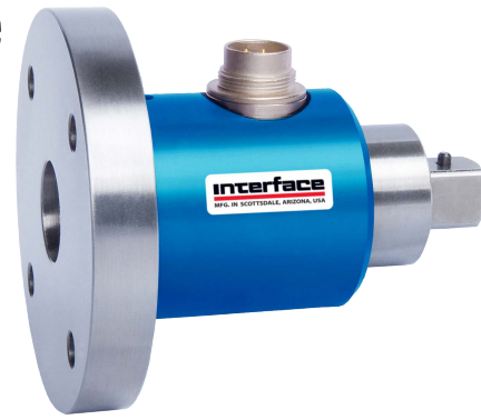
TS16 Square Flange Style Reaction Torque Transducer