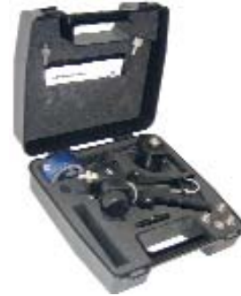
Pneumatic and hydraulic test kit