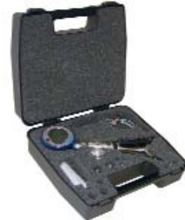
Pneumatic test kit