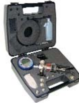
Hydraulic test kit