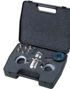
Low pressure pneumatic test kit

Includes DPI 104-IS; ranges to 10,000 psi (700 bar), PV 411A combined pneumatic and hydraulic test pump, hydraulic reservoir, hose, adaptors, seal kit and case