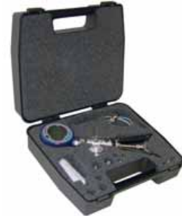
Pneumatic test kit