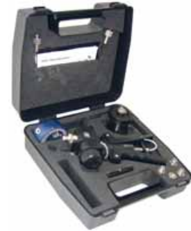
Pneumatic and hydraulic test kit