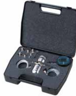
Low pressure pneumatic test kit

Includes: DPI 104; ranges to 10,000 psi (700 bar), PV 411A combined pneumatic and hydraulic test pump, hydraulic reservoir, hose, adaptors, seal kit and case.