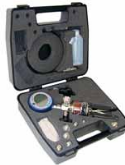
Hydraulic test kit